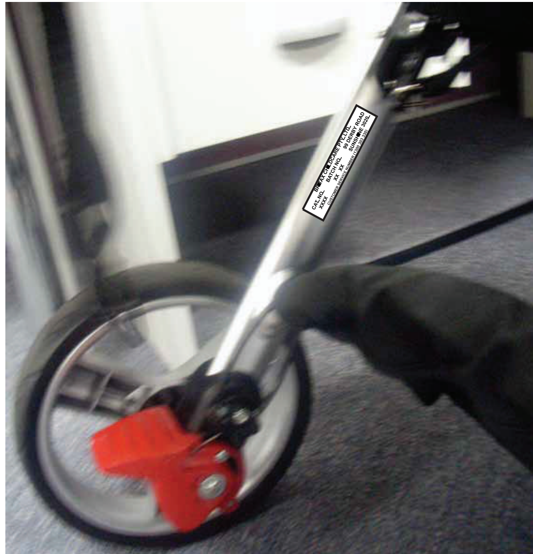
Date of Manufacture Label to be placed on the inside of the rear leg